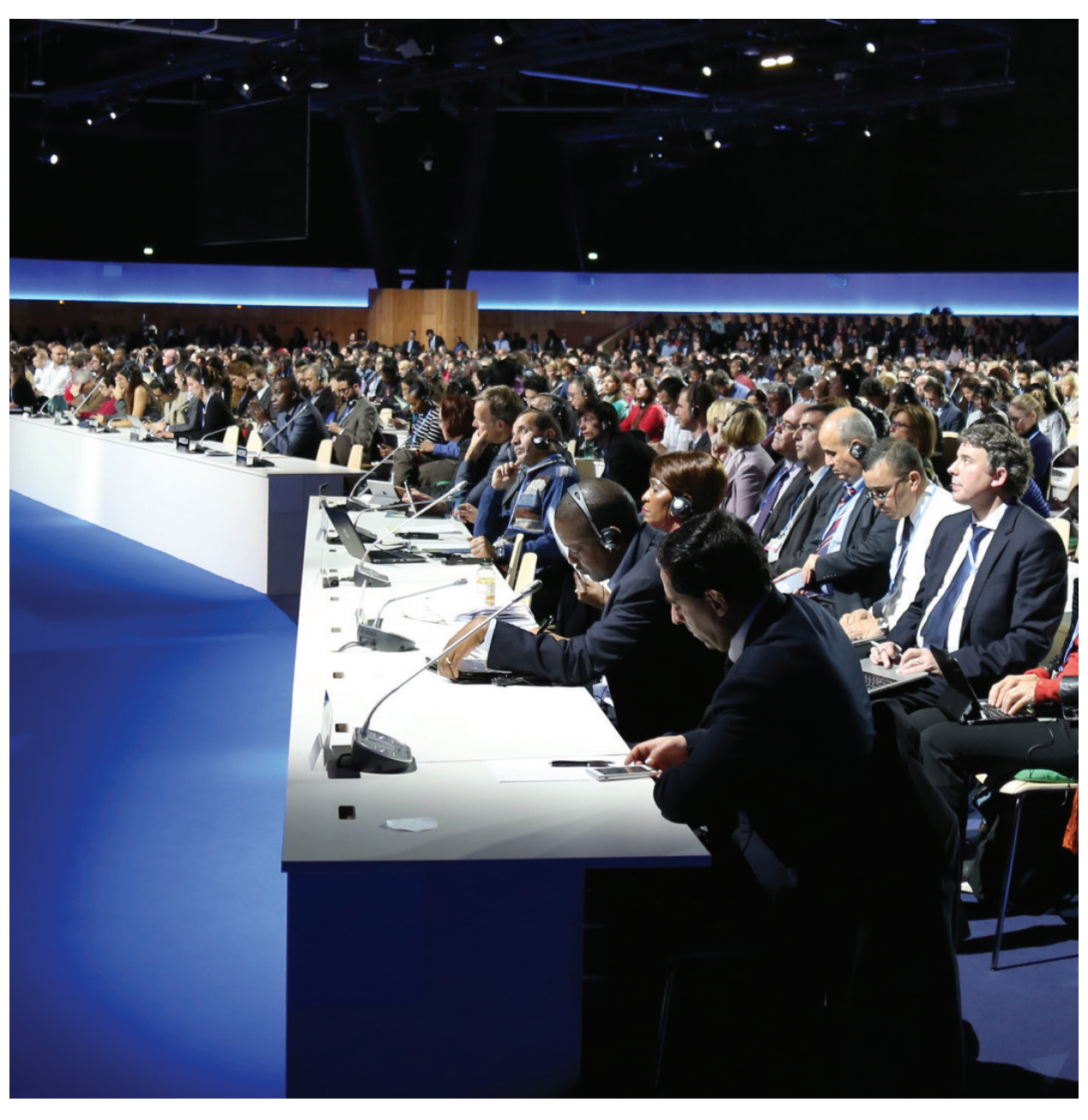
One of the plenary halls at the 21st Conference of the Parties to the UNFCCC where the historic Paris Agreement was adopted.

The ICC pleaded with UNFCCC high-level champions to ensure that business stay key to UNFCCC decisions." It recommended weaker regulations for business, including the recommendation that climate action be voluntary for business rather than mandatory.111